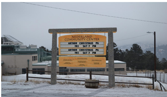
And in with the new?